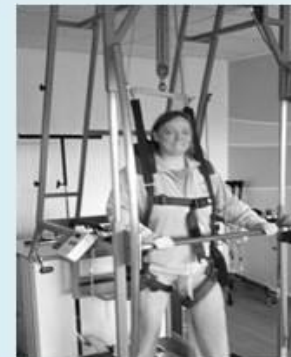
High-Tech in REHA Center